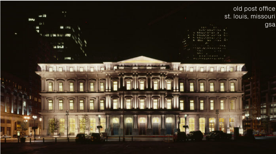
old post office st. louis, missouri gsa

Today, while continuing our commitment to St. Louis, we work for a range of clients across the country providing expertise in civic, education, hospitality, housing and workplace architecture while maintaining an intentional combination of historic renovation, adaptive reuse, and new construction.