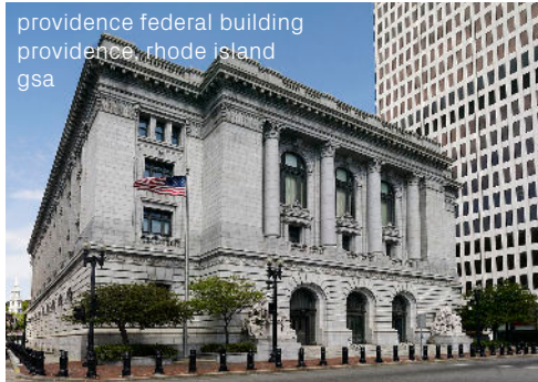
providence federal building providence, rhode island gsa