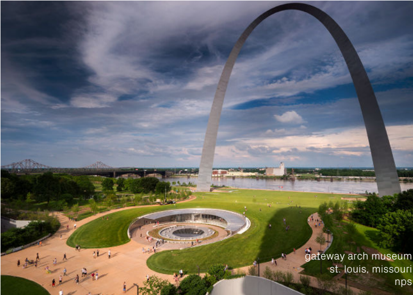
gateway arch museum st. louis, missouri nps