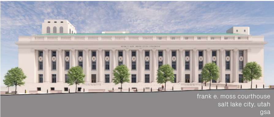
frank e. moss courthouse salt lake city, utah gsa