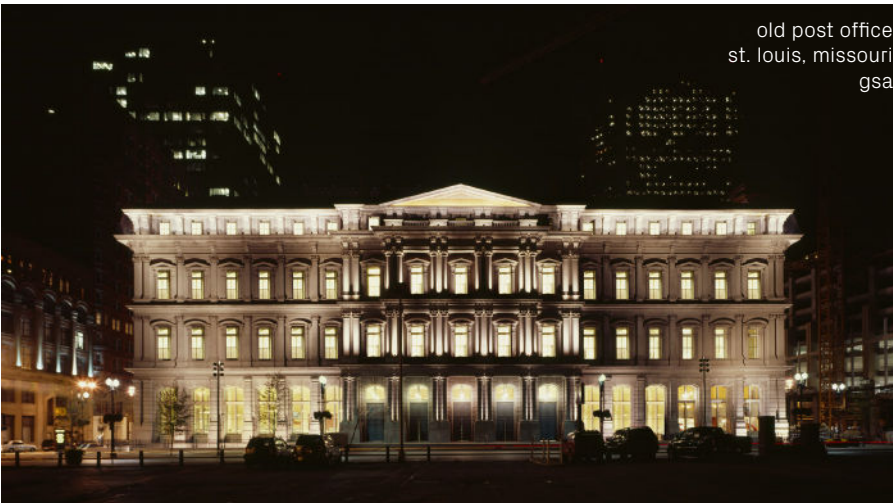
old post office st. louis, missouri gsa

Today, while continuing our commitment to St. Louis, we work for a range of clients across the country providing expertise in civic, education, hospitality, housing and workplace architecture while maintaining an intentional combination of historic renovation, adaptive reuse, and new construction.