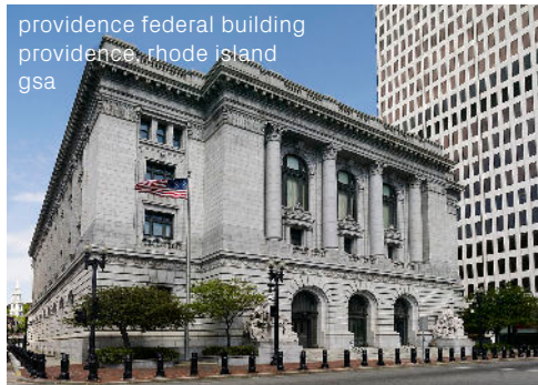
providence federal building providence, rhode island gsa

US General Services Administration US Army Corps of Engineers National Park Service US Postal Service Department of Veterans Affairs US Department of the Interior US Forest Service