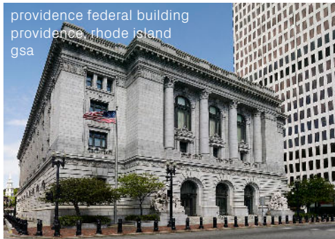
providence federal building providence, rhode island gsa

Trivers qualifies as a Small Business Enterprise by the U.S. Small Business Administration.